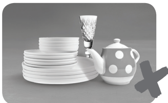
Dishes, ceramics or crystal