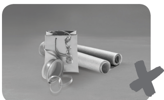
Wax or foil coated paper