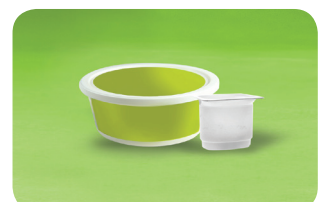
#4, #5 and #7 plastic containers