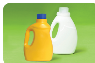
HDPE #2 plastic containers