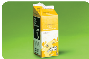
Gable top containers