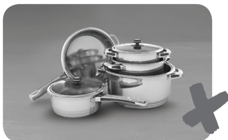
Steel pots and pans or scrap materials