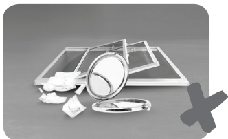
Window glass, mirrors or broken glass