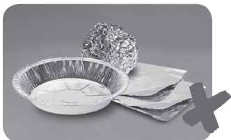
Aluminum foil, foil pie plates or foil food containers

Please do not place any of these items in your blue bins: