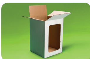
Residential corrugated cardboard