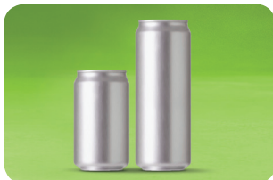
Aluminum food and beverage containers