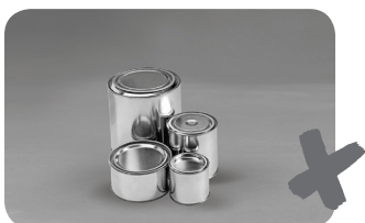
Paint cans or oil cans