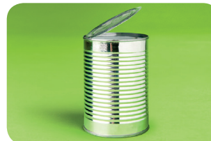
Steel food and beverage containers