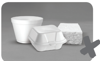
Foam packaging of any kind