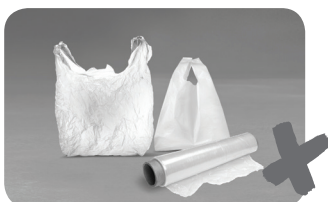
Plastic bags or cellophane