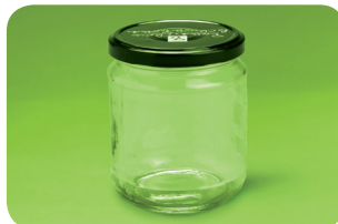
Glass food and beverage containers