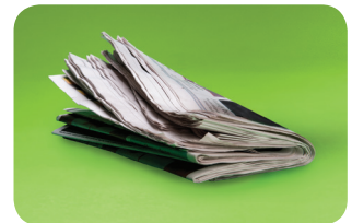
Newspapers and flyers

These are types of recyclable materials accepted in your recycling program: