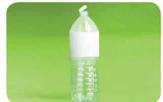
PET #1 plastic food and beverage containers