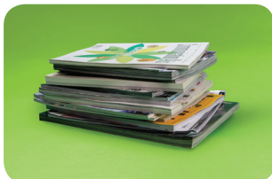
Magazines and catalogues